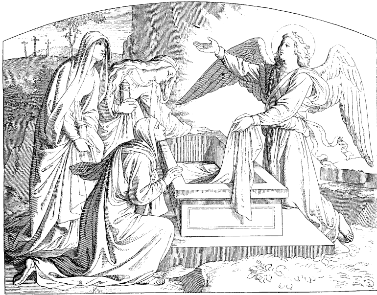
Illustration from a German Bible published in 1850 from Historic Trinity's Dau Library of church history.