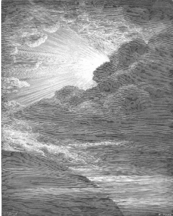
Gustave Doré – The Creation of Light

The first sentence in the Bible is “In the beginning God created the heavens and the earth.” This was the beginning of the earth and the universe. It was not the beginning of God. God always was. God is eternal. God is without beginning and without end.