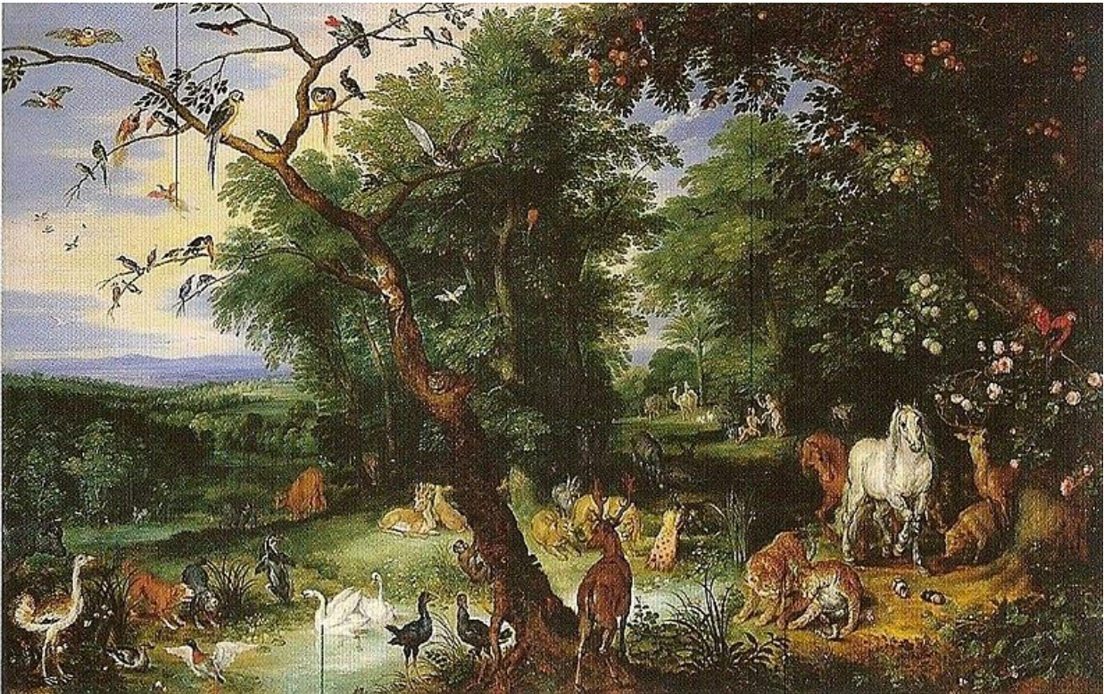
The Garden of Eden. Oil painting by Jan Brueghel, The Elder, 1630

Prayer: Dear Lord God, thank you for making the world. Help me to see the beauty in what you made – the colors of the sunset, the sparkle of the sun on the water, the majestic mountain tops, the graceful flight of birds. Help me to respect and take care of the world you made and the animals who live in it. Thank you for loving me and watching over me. Amen.