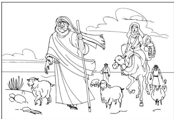
God guided Abraham.

The coloring page, God Guided Abraham, can be downloaded at SundaySchoolZone.com . The coloring page is free to duplicate for church or home use.